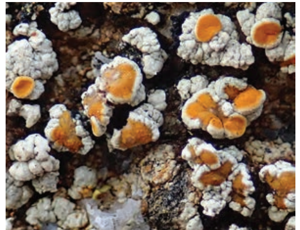
Caloplaca maculata on Chatham Island; At Risk – Naturally Uncommon.

algae, cyanobacteria and even yeasts. All of these very different organisms work together as the lichen we see to eke out an existence, in a bewildering array of habitats from the rocks in the dry valleys of Antarctica, to the summit of Aoraki/Mt Cook, and even on the plates of barnacles on our shorelines. Lichens are not really species but we treat them as such and, because it is the fungus that forms the super-structure and mostly has the highest diversity, it is the fungi that we use to classify them.