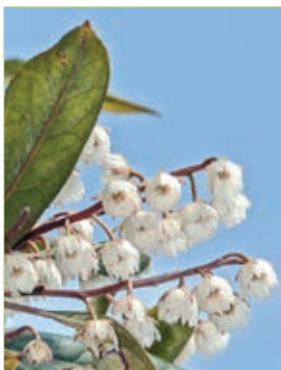
Elaeocarpus dentatus .