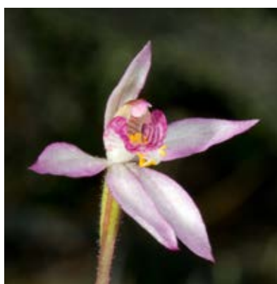
Fig. 2. Caladenia alata flower.

Flowering from August, early for a Caladenia , and being very slight at only 100 mm high with a 10 mm diameter pink or white flower (fig. 1), it is easily overlooked. When you see a flowering specimen, its beauty is undoubtable. A macro lens may be required to fully appreciate this rarity, like all of our orchids, perfectly formed but