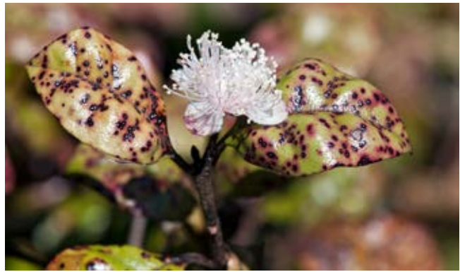
Fig. 4. Lophomyrtus bullata .

susceptible of our native species to myrtle rust. Most people have probably seen ramarama in the wild and thought, wow what an amazing leaf. This species, a member of the myrtle family, has very showy flowers similar to pohutukawa, yet smaller and white (fig. 4). The future of this species is somewhat uncertain, being found mostly in North Island with only a few populations in South Island; the effects of myrtle rust cannot be easily measured or estimated. Here's what the voters had to say: