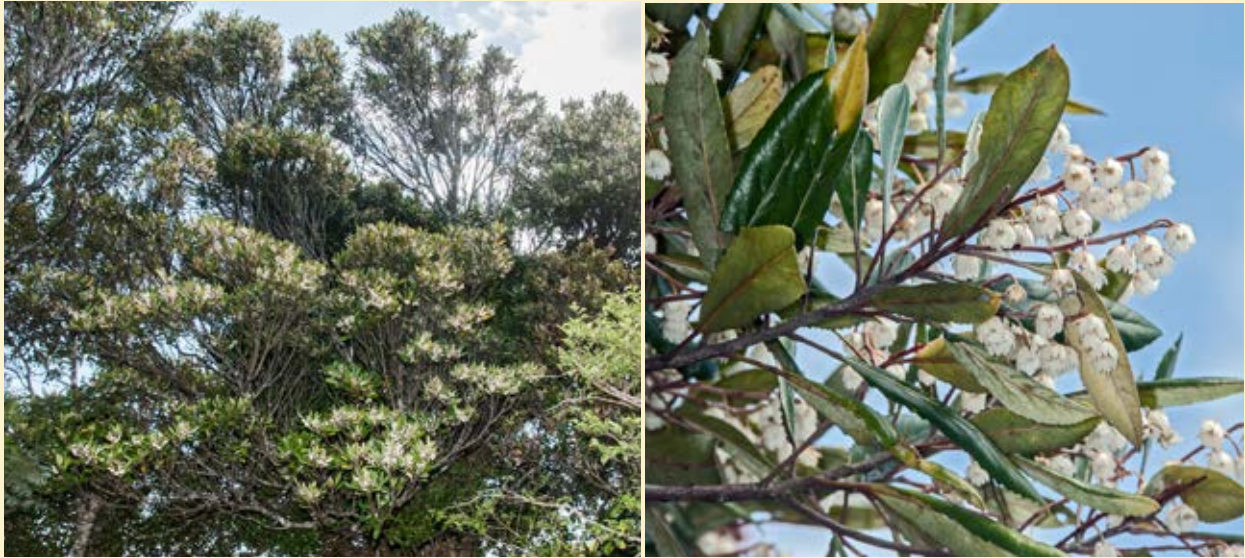
Elaeocarpus dentatus var. dentatus .

The plant of the month for December is the mighty hinau, Elaeocarpus dentatus , one of two Elaeocarpus species endemic to New Zealand. The species is divided into two varieties, E. dentatus var. dentatus , and var. obovatus . Variety dentatus is found throughout the lowland forests of the North Island and in the South Island down to Christchurch in the east, and Whataroa in the west. Variety obovatus is found only from the Marlborough Sounds to North-West Nelson. Hinau trees can reach 15–20 m high and reach a trunk diameter of at least 1 m, but are not generally the dominant tree species. The bark is hard and smooth with distinctive longitudinal fissures on mature trees. The leaves are quite harsh to the touch with serrated margins and domatia pits (hairy pits) on the underside. There are two leaf forms; those on juvenile plants are much longer and generally thinner than the adult leaves. The white flowers are borne in racemes and make for a spectacular sight on heavily laden trees. The dark purplish green fruit mature in autumn and are great food for kereru. Hinau fruit were also a very important food source in pre-European times, with the nutritious floury flesh being separated from the hard seeds and either boiled as a gruel or fashioned into bread like cakes and cooked.