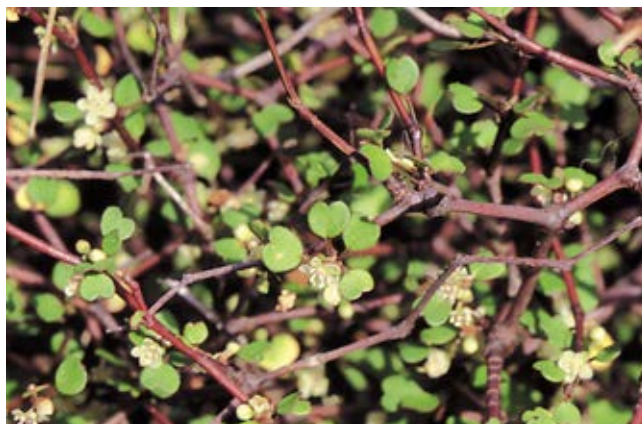
Fig. 3. Muehlenbeckia astonii.