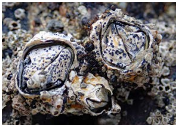
Collemopsidium sp., Piha Beach.

The large number of 'Data Deficient' lichens highlights an ongoing problem; there are simply not enough lichen experts in New Zealand to survey for and document our lichen diversity. Increasingly, New Zealand people need to work with international experts to find out what lichens we have, and whether those we thought were the same as ones found overseas really are. Conversely, New Zealand is continuing to awe and amaze the world lichen community as the unexpected keeps on being discovered. For example, one Spanish visiting researcher examining a lichen that lives on barnacles ( Collemopsidium ) discovered in a single day's random sampling along western Auckland's shoreline several new species and, in the process, recognized that the single name, C. sublitorale , that we had been using for all of this diversity was probably wrong.