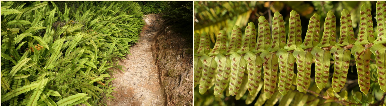
Nephrolepis flexuosa , Rainbow Mountain, Waiotapu 17 December 2021: (left) growth habit; (right) underside of frond showing sori arrangement.

The plant of the month for December is Nephrolepis flexuosa , one of two native species of Nephrolepis found in the New Zealand region. The species is found on the Kermadec Islands and the North Island from about Kawerau to Lake Taupo. The species is also found on Norfolk Island, Lord Howe island, Fiji, the Cook Islands, and possibly in other places in the Indian and Pacific Oceans. In the New Zealand region, it inhabits only geothermally active sites. Tokaanu, near Turangi is the world's southern limit for this largely tropical species, where geothermal activity keeps year-round temperatures higher than they would be usually at this latitude. The species is one of a small suite of plants that can tolerate the high temperatures and acidity of these sites. In the North Island it is usually associated with Kunzea tenuicaulis shrubland but can also grow in the damper, active steam vent areas.