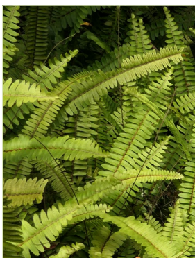
Nephrolepis flexuosa .