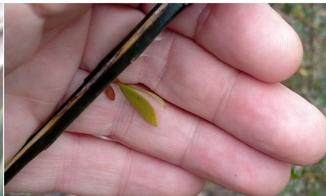
Fig. 1 (left): Germinating green mistletoe seed on underside of lancewood leaf. Fig. 2 (right): Germinating green mistletoe seed showing top surface of lancewood leaf. Photos: John Barkla, 17 July 2021.