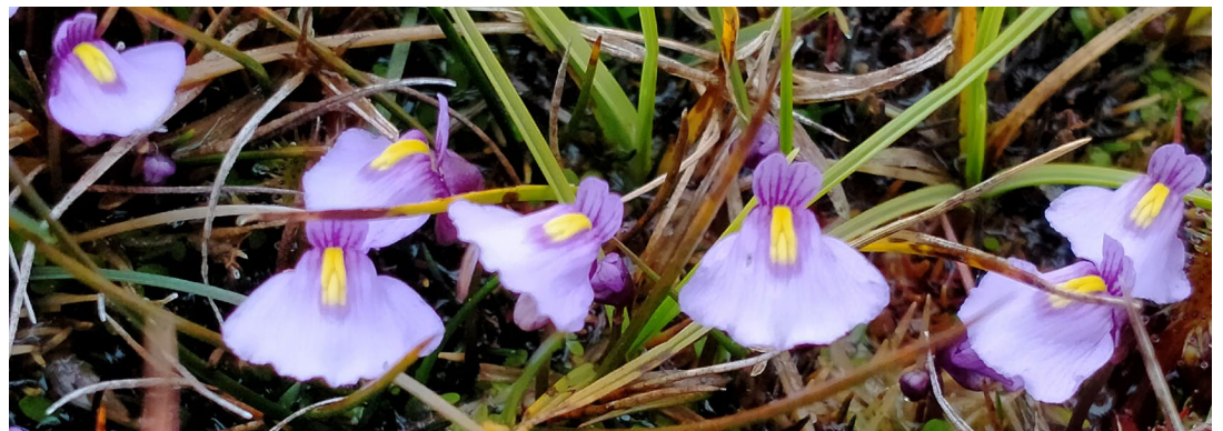
Utricularia dichotoma subsp. novae-zelandiae , Mount Kyeburn December 2021.

Lower down, in a comb sedge ( Oreobolus pectinatus )-dominated bog at 1200 m asl, we encountered loads of purple-flowering bladderworts ( Utricularia dichotoma subsp. novae-zelandiae ), Celmisia alpina , sundew ( Drosera arcturi ) and Bulbinella angustifolia .