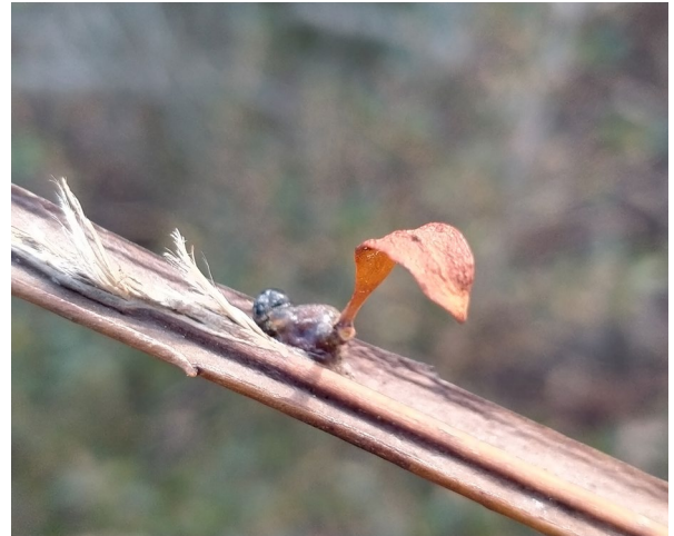
Fig. 3: Single remaining desiccated leaf of green mistletoe seedling. Photo: John Barkla, 8 September 2021.

It's well known that germinating seeds of Ileostylus can produce their first set of leaves prior to making haustorial contact with their host (Smart 1952). The germinating seed did not appear to have physically penetrated its host and the leaves it produced were presumably nourished solely by the endosperm. At this early stage of development, the mistletoe was effectively independent of its host.