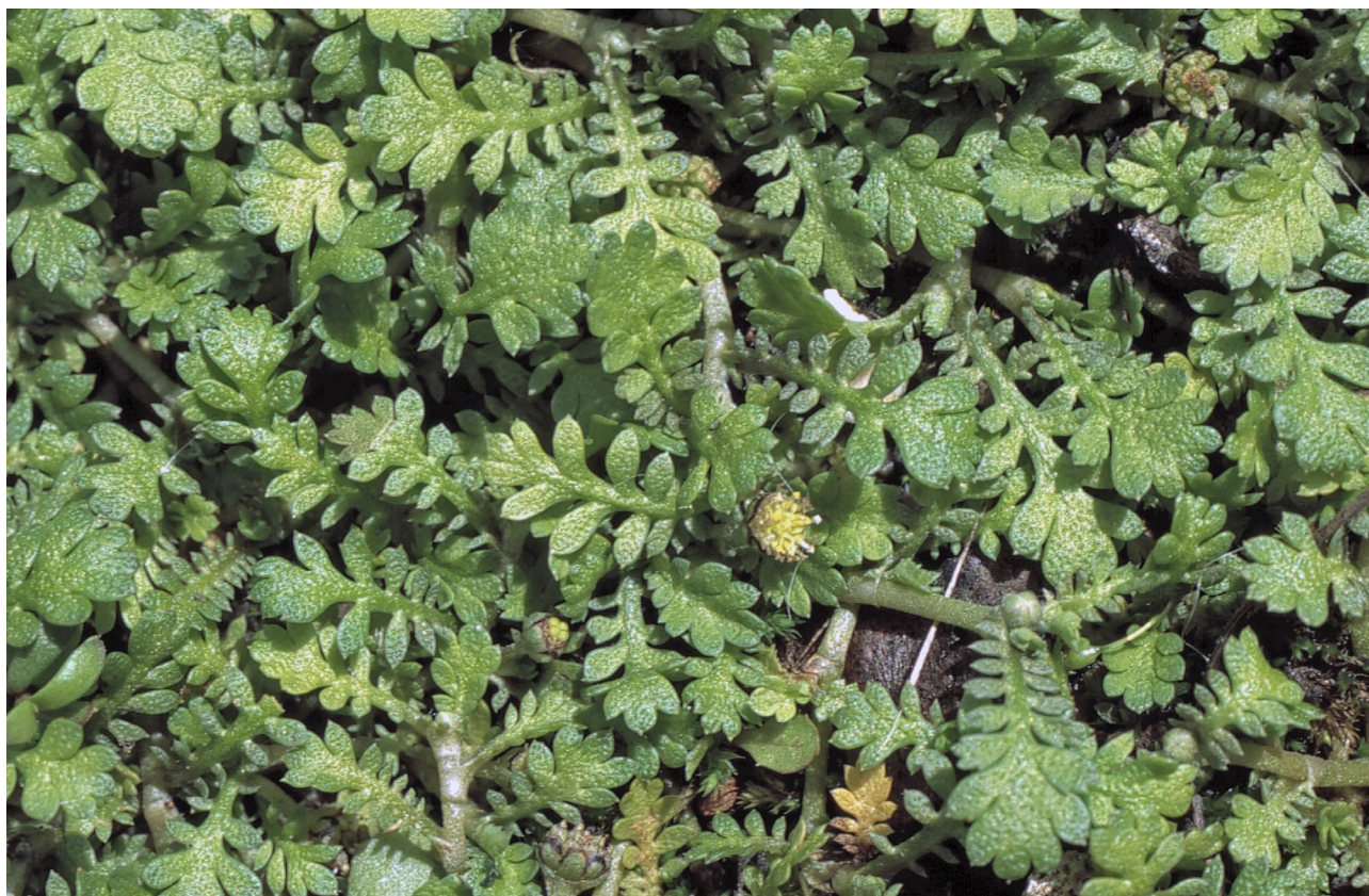
Leptinella nana, New Zealand’s favourite plant of 2021.