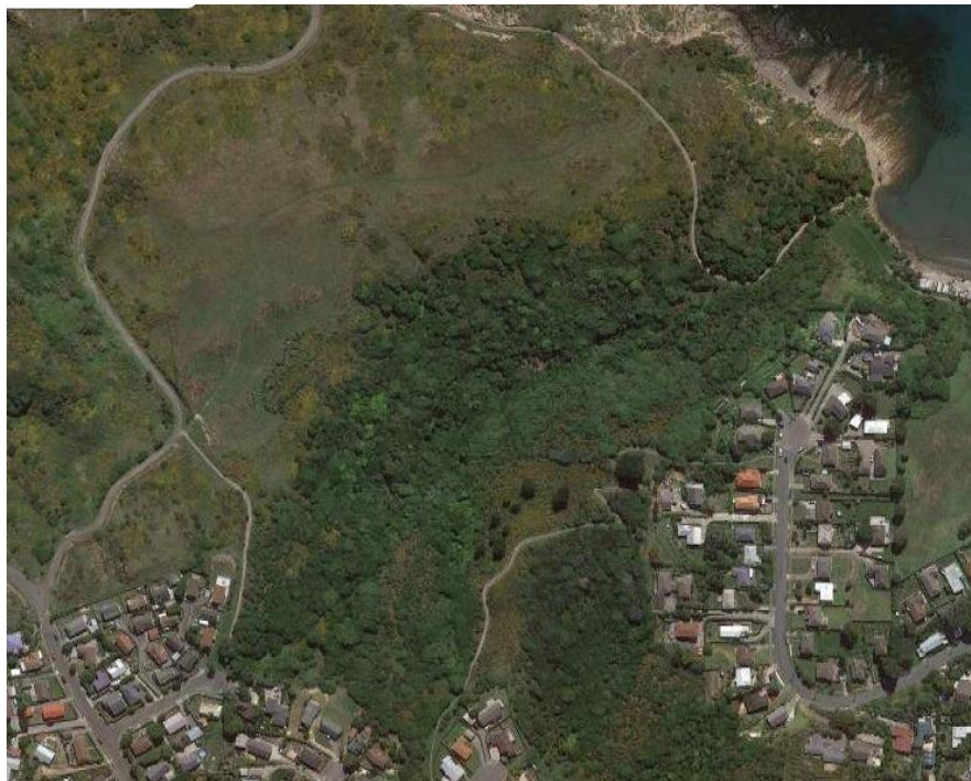
Satellite image of Stuart Park bush in 2022