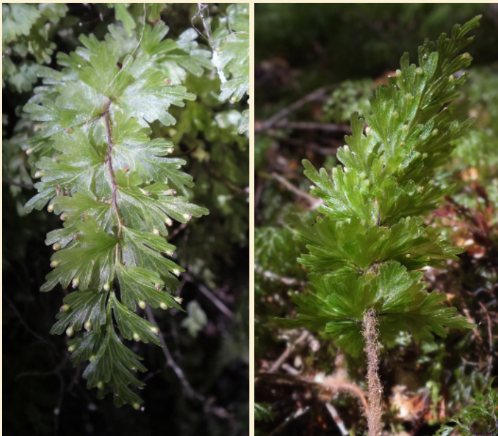
Hymenophyllum flabellatum , Waitutu, Fiordland, 19 October 2013: (far left) upper surface of frond with developing sori at the tips; (left) lower surface of frond and hairy stipe.

The fern is a rhizomatous creeping species, sometimes forming large, dense patches on the shaded side of tree trunks or rocks. The rhizomes are thin and wiry with villous hairs, allowing them to cling strongly to various substrates. The fronds arise individually from the rhizomes and have wiry stipes (leaf stems) that have a scattering of pale white or yellow hairs covering them. The lamina (leafy part) is generally pale yellow-green, with the pinnae (fern leaflets) being smooth edged and arranged in such a way that they look to be layered up the main stem (rachis) like the rings of branches on a Christmas tree. These pinnae (fern leaflets) are further divided once or twice into small leaflet like divisions. The sori (tiny spore holding structures) are positioned at the end of the pinnae, are smooth, and are ovoid to rotund in shape.