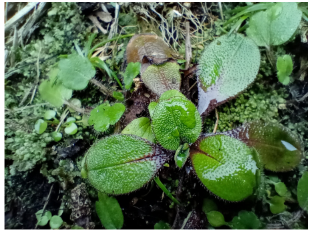
Figure 4: Myosotis antarctica subsp. traillii .

Sandymount Recreation Reserve can be accessed by turning off Highcliff Road (along the spine of the Peninsula) onto Sandymount Road. The track begins at the end of the road, initially through a ‘tunnel’ of historic macrocarpa trees. A prominent viewpoint has stunning views to the northeast over Allans Beach, Hoopers Inlet, Poatiri/Mt Charles and inland to Hereweka/Harbour Cone. Continuing on a marked coastal circuit takes about an hour, with an option to access Sandymount summit. There are plenty of opportunities to explore beyond the marked routes too but caution is required around steep slopes and cliffs. The reserve is closed for lambing from 1 September to 15 October.