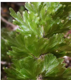
Hymenophyllum flabel-latum .