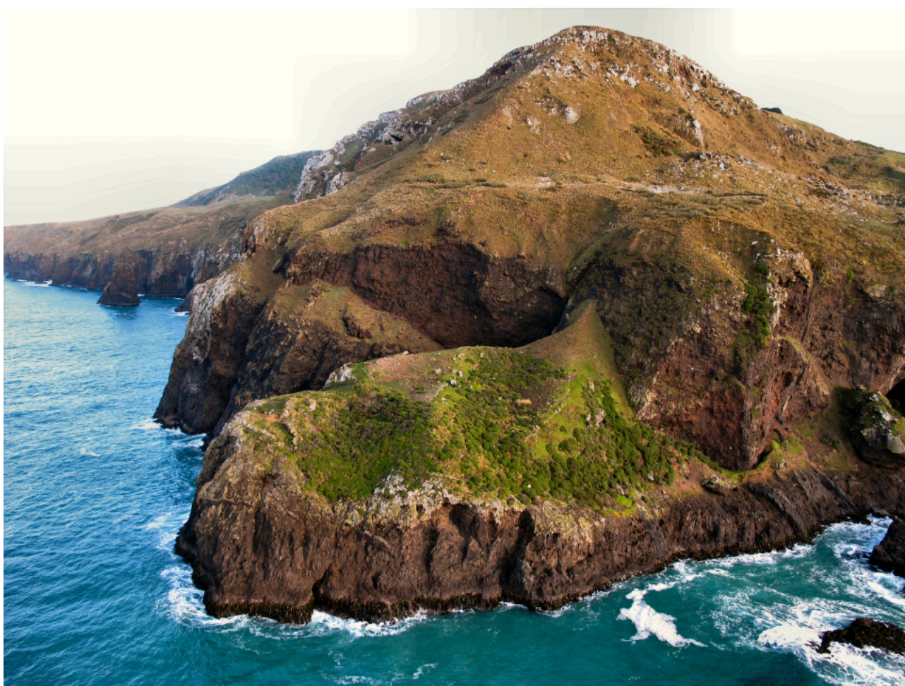
Figure 1: Many rare and special plants occur on steep coastal hillslopes.

As is true elsewhere on the Otago Peninsula, a significant number of rare and special plant species occur on cliffs and coastal banks (Peat & Patrick 2014), where their inaccessibility to grazers and browsers affords some degree of protection (Fig. 1). Such sites support coastal forest, shrublands, short tussockland, and herbfields. More accessible and gentle terrain is grazed by sheep under a DOC concession and comprises exotic grassland and silver tussock dominated tussockland.