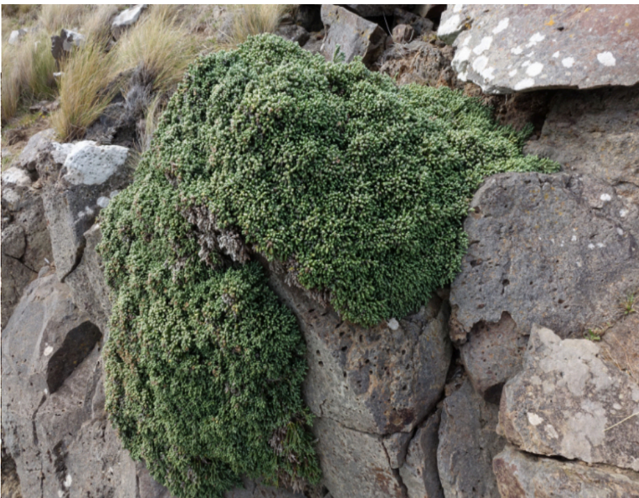
Figure 3: Cape Saunders rock daisy, Harakeke Point, Sandymount Reserve.

outcrops, producing pale yellow flowers in summer (Fig. 3). This nationally vulnerable taxon is much stouter than its inland relatives. The second shrub is a genetically distinct Melicytus ( M. aff. obovatus “Cape Saunders”) with dioecious flowers that have a purplish tinge. Due to its relatively recent discovery and recognition, this taxon is un-ranked in the NZ threat classification system (Townsend 2008). It forms stiff, tightly interlaced mounds up to 4 m across, often as part of coastal shrubland.