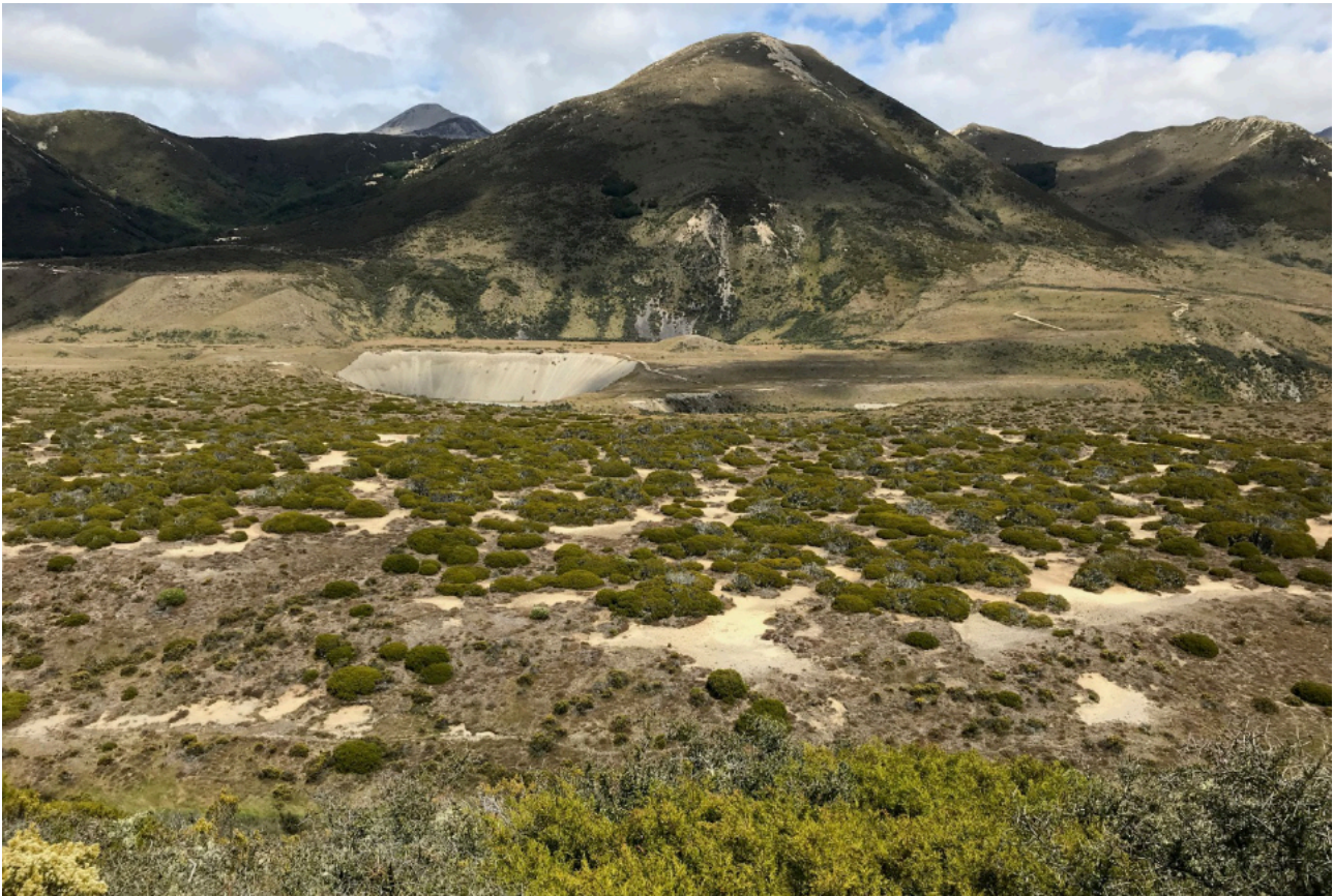
Strongly leached terraces with bog pine ( Halocarpus bidwillii ) vegetation at Mt White Station, home to the only remaining large population of Veronica armstrongii .

Veronica armstrongii was first described from the upper Rangitata catchment, where it is now presumed extinct. The largest remaining V. armstrongii population is at Mt White Station (in the Pūkio Valley), and numbered more than 1,700 adult plants in 2001 (Hustedt 2002). The second extant population, at Enys Scientific Reserve, had only six plants in 1974 (Molloy 1990), but has since increased to 83 adult plants and 279 juveniles, following nursery-raised restoration plantings using seed collected from the reserve (Nelson et al. 2018).