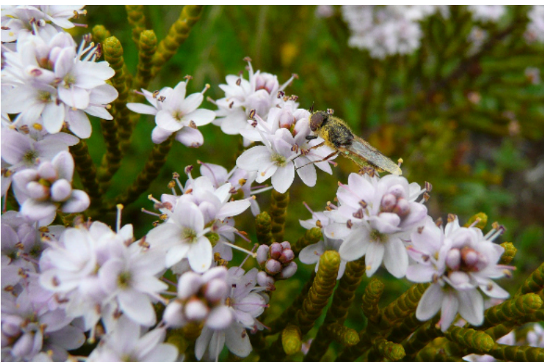
A native fly covered in pollen visiting Veronica armstrongii flowers at Enys Scientific Reserve, Canterbury. Genetic material can potentially move between populations via seeds or pollen, but we found no sign of recent gene flow between Enys Reserve and Mt White.

We were able to test nine cultivated V. armstrongii plants from a range of nurseries and gardens, but none of these had genetic diversity that was absent in the wild populations.