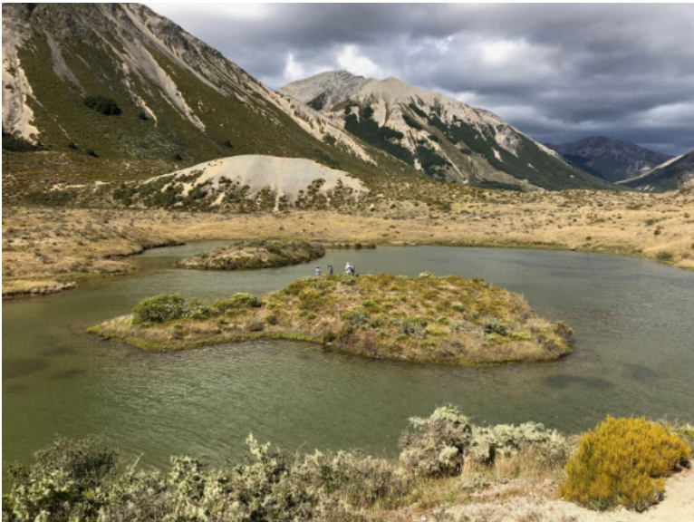
The field team collecting samples for genetic research on Hebe Island, home to one of the two subpopulations of Veronica armstrongii at Mt White Station.

Based on our findings, the Enys Reserve and Mt White populations should be treated as separate conservation management units. The genetic diversity of the two Mt White sub-populations and the two groups at Enys Reserve should also be maintained. Further research is needed on the genetic structuring found within the Enys population, and may help explain why a population that was reduced to only six plants still has a similar amount of genetic diversity as a population that did not undergo a bottleneck. The cultivated V. armstrongii plants included in our study should not be relied on as a source of additional genetic diversity when planning conservation management.