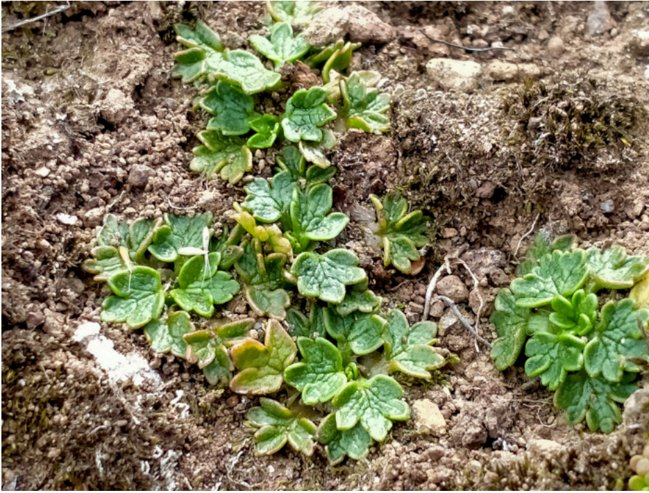
Figure 2: Ranunculus recens .

outcrops, producing pale yellow flowers in summer (Fig. 3). This nationally vulnerable taxon is much stouter than its inland relatives. The second shrub is a genetically distinct Melicytus ( M. aff. obovatus “Cape Saunders”) with dioecious flowers that have a purplish tinge. Due to its relatively recent discovery and recognition, this taxon is un-ranked in the NZ threat classification system (Townsend 2008). It forms stiff, tightly interlaced mounds up to 4 m across, often as part of coastal shrubland.